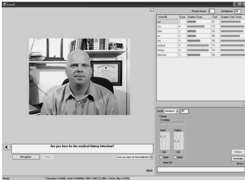
Figure 3: Feedback on Pronunciation

Some adjustments to the system's speech recognizer are available to the learner by using a settings panel at the lower right of the screen. Using the mouse, the learner can change the microphone sensitivity, headset volume, and recognition threshold. The advantage of being able to set the recognition threshold to a lower or higher level is that the learner can make Danny more or less forgiving of pronunciation errors and thus make the pronunciation demands of the experience less frustrating or more challenging according to the learner's individual needs.