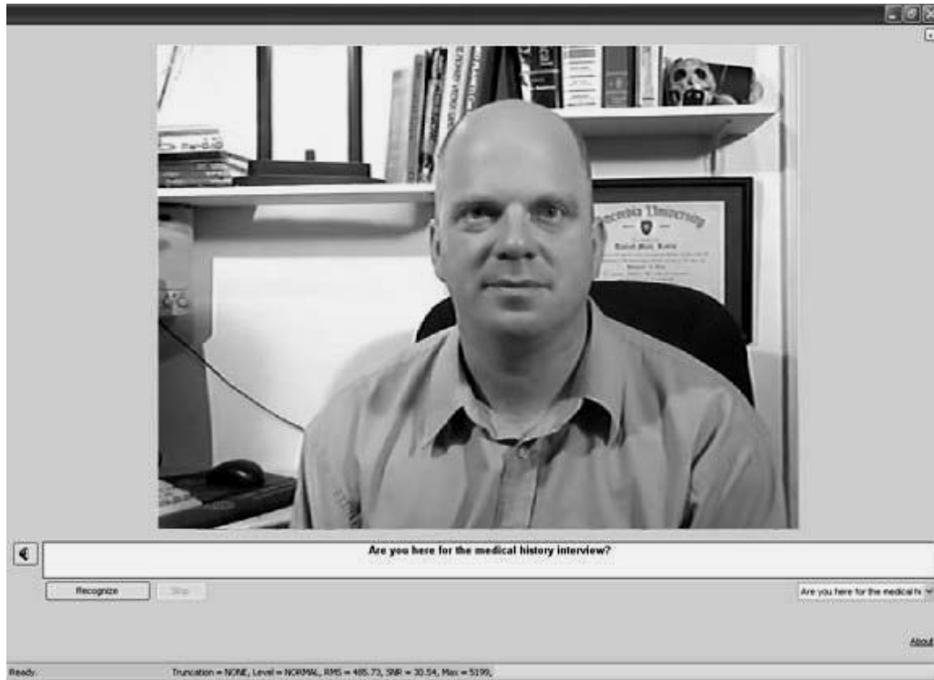
Figure 2. Graphical User Interface

At the same time, a feedback panel is displayed after each successful recognition, providing feedback on confidence ratings associated with each word and the whole utterance (Figure 3). Ratings for words that fall below a threshold are displayed in red, otherwise in green. The learner can thus get a sense of which words he or she needs to say more clearly. When the entire sentence does not meet the software's threshold of what is acceptable due to either poor microphone placement or errors in pronunciation, a video with a request for the learner to try again (i.e., Could you say that again, please? ) plays and an opportunity to try again is made available. The learner may at this point wish to hear an audio recording of a native speaker pronouncing the sentence. This is possible at any time by clicking a button to the left of the question prompt (identifiable by its small speaker icon) and then listening to the recording through the headphones. Though the patient can ask the learner to repeat, with this early prototype, it is not yet possible get the virtual patient to repeat, slow down or explain by uttering a voice command.